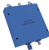
IMAGE REJECT MIXER