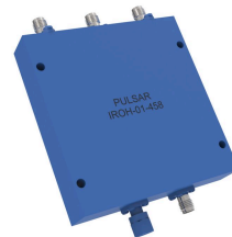
IMAGE REJECT MIXER