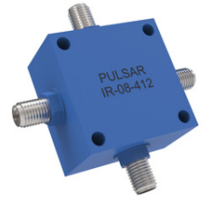
IMAGE REJECT MIXER