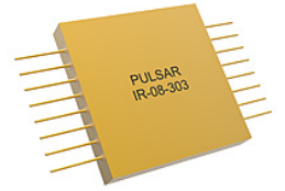
IMAGE REJECT MIXER