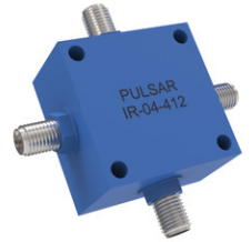
IMAGE REJECT MIXER